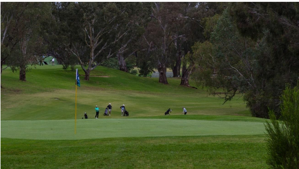
upcoming growing season.