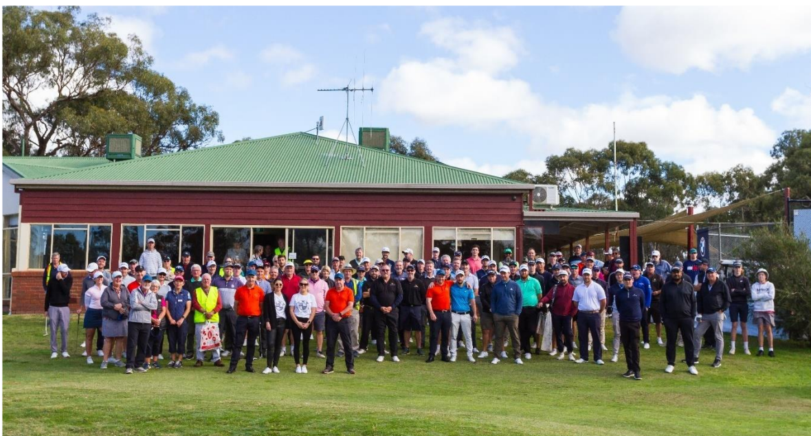
gathering at the 2022 Symes Motors BMW Axedale Pro-Am.