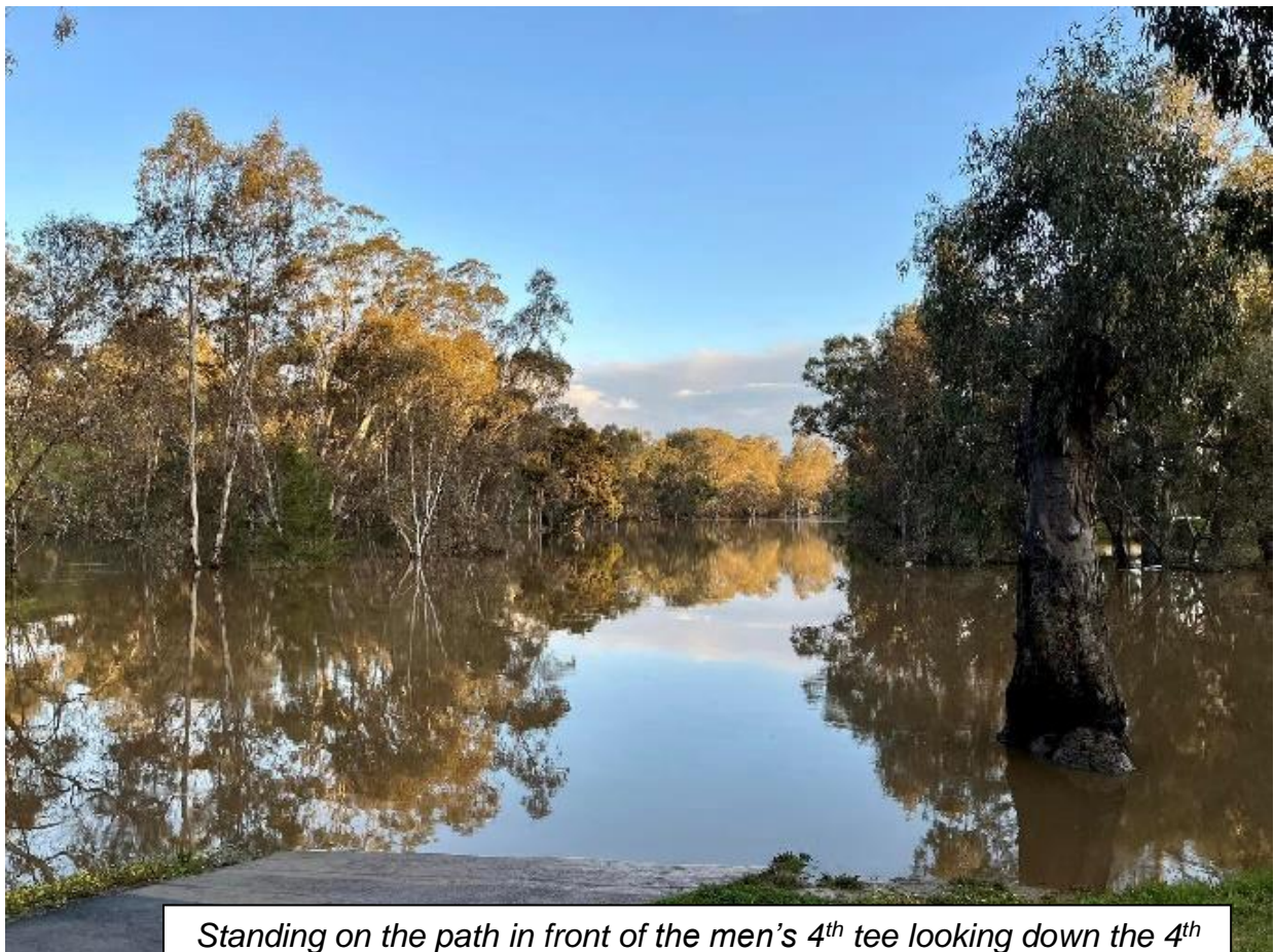
Standing on the path in front of the men's 4 th tee looking down the 4 th fairway. The big tree on the right is behind the 3 rd green.

All that is visible of the roof of both the cart shed and old pavilion.