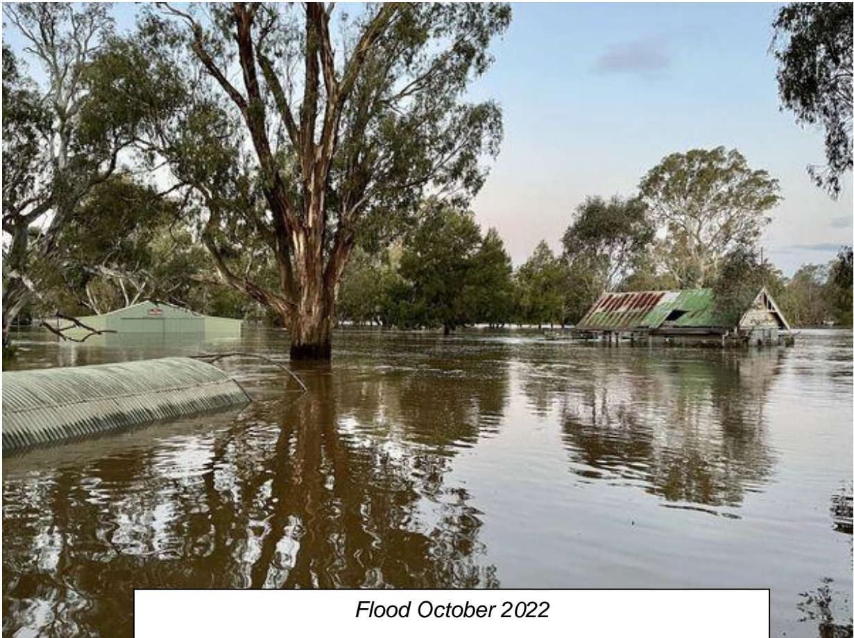
Flood October 2022

All that is visible of the roof of both the cart shed and old pavilion.