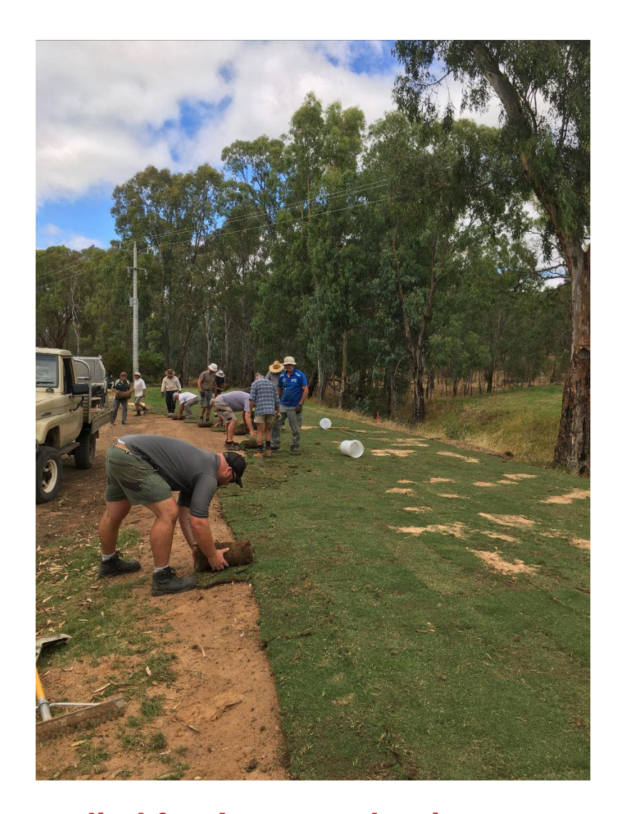
Gardens readied for Autumn planting

Management representatives for approving development of our turf nurseries. BELOW: Another 'sod' of a project! The huge area between the old men's and women's 17th tees was transformed into one 50-metre-long teeing ground, which will enable us to spread the wear whilst occasionally moving the men's tee so far forward that even your estimable newsletter editor can drive a ball over the hill!